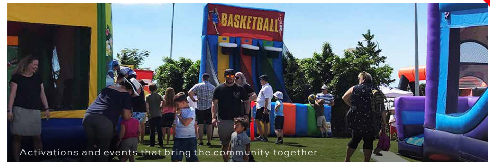
Activations and events that bring the community together