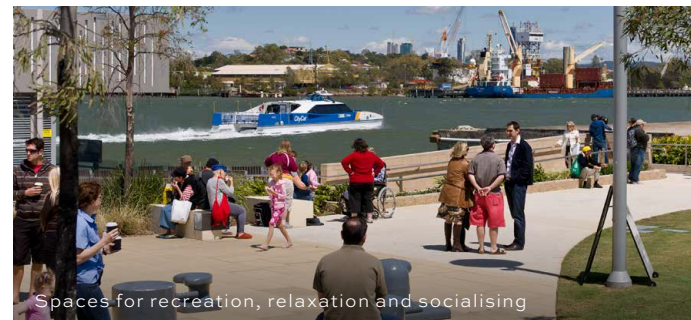
Spaces for recreation, relaxation and socialising