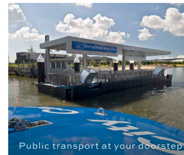
Public transport at your doorstep