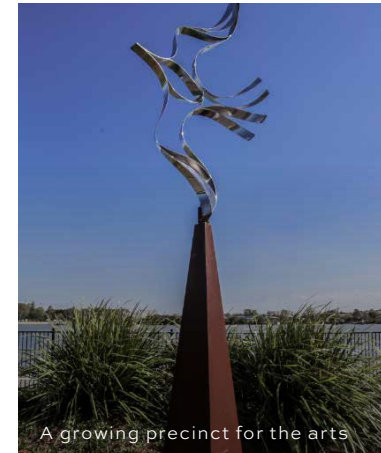
A growing precinct for the arts