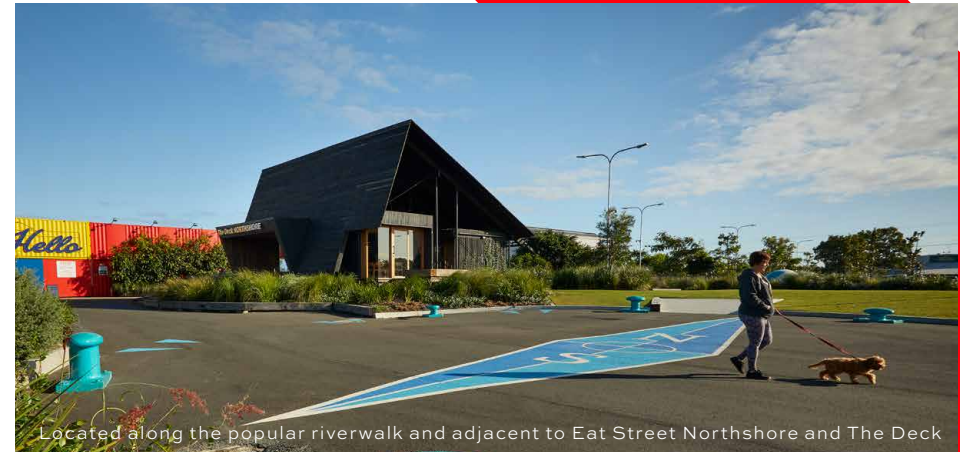
Located along the popular riverwalk and adjacent to Eat Street Northshore and The Deck

Economic Development Queensland is a government agency within the Department of State Development, Infrastructure, Local Government and Planning which combines property development, innovation and activation strategies with specialist planning functions to create places and investment opportunities for Queenslanders to prosper.