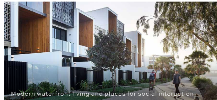
Modern waterfront living and places for social interaction