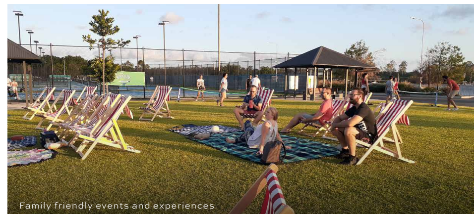
Family friendly events and experiences