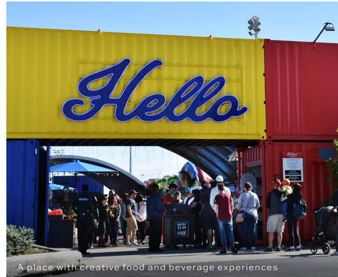
A place with creative food and beverage experiences

Collective Event Space has hosted activations including the outdoor screening of the Australian Open Finals, family fun days featuring large inflatables and water slides and fitness boot camps.